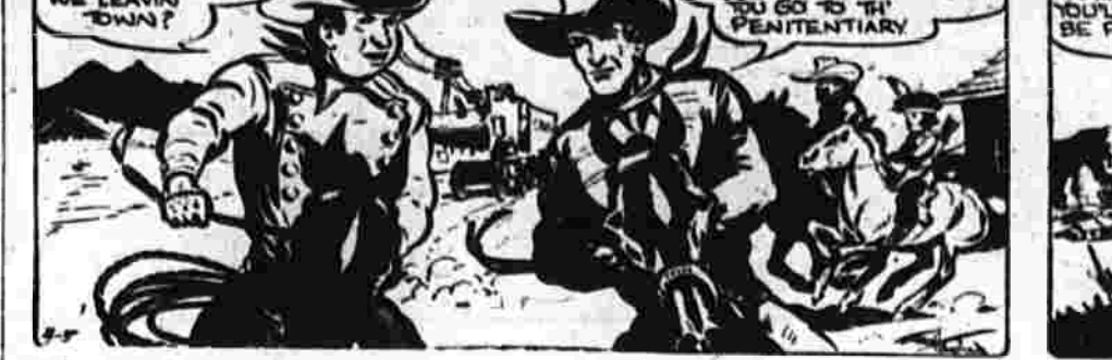
RED HYDER Home Again