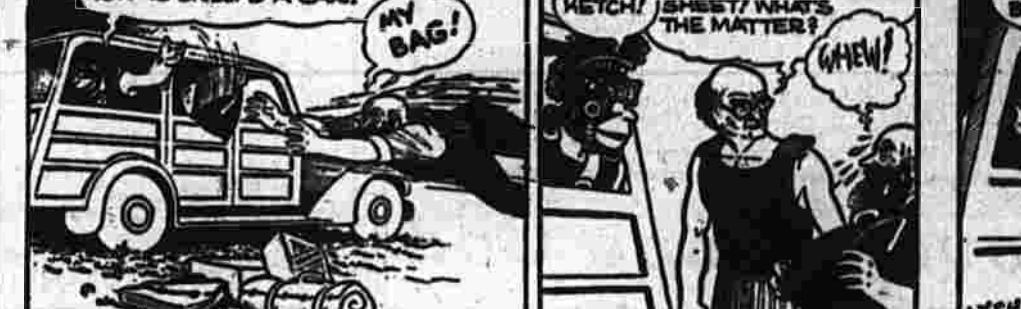
WASH TUBBS Careful, Rodrigo BY ROY CREAM